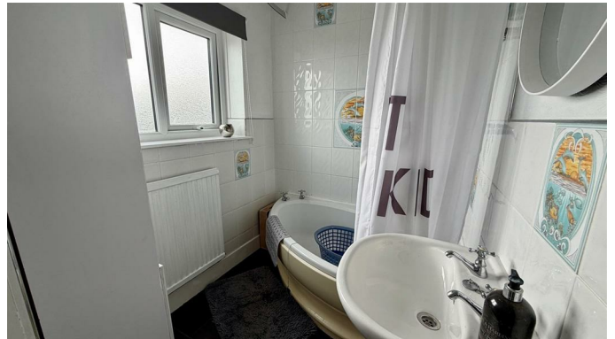
2 PIECE BATHROOM

Suite comprising corner bath with mains shower over, pedestal wash hand basin, linen cupboard with shelving, wall tiling, tile effect flooring, upvc double glazed window.