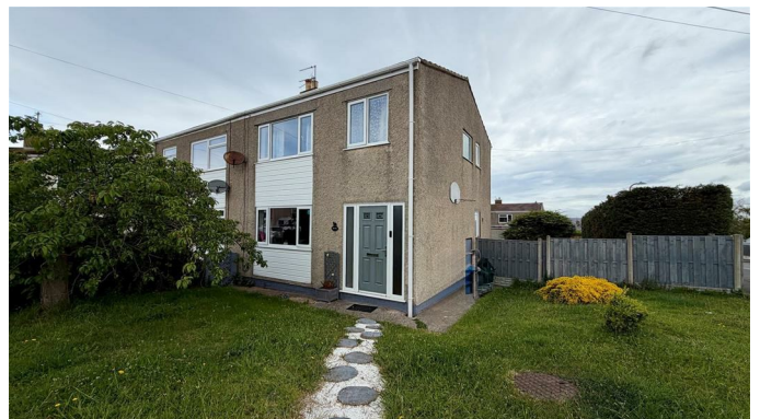
FRONT AND SIDE CORNER GARDEN