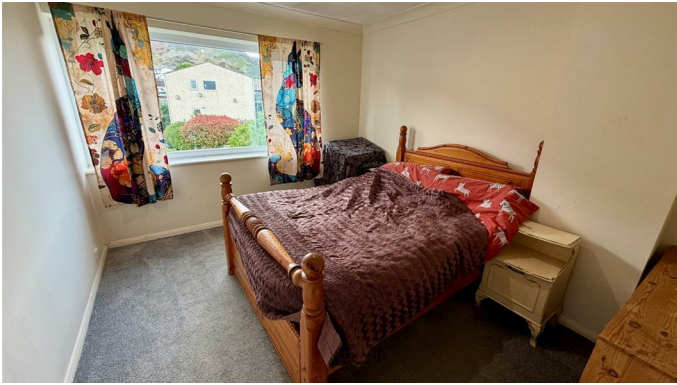
BEDROOM 1 11'8" x 9'11" (3.56m x 3.03m)

Coving, radiator, upvc double glazed window to front with distant mountain views.